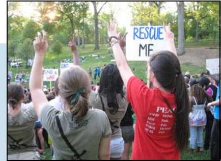
In celebration of Global Youth Service Day 2009, PTPI's Atlanta, Georgia Student Chapter raised funds and awareness about the war stricken Darfur region. The chapter also attended the Invisible Children global event "The Rescue."