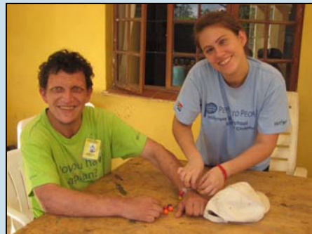
In celebration of GYSD 2009, PTPI's Durban, South Africa (Hillcrest High School) Student Chapter spent time with handicapped individuals at Hillcrest Farms as one of three GYSD projects carried out by the chapter.