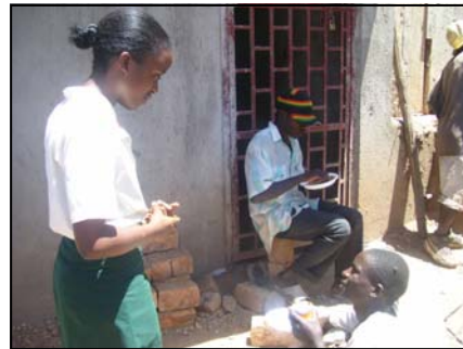
In celebration of Global Youth Service Day, PTPI's Kampala, Uganda (Angels of Humanity) Student Chapter visited a slum in the Kisenyi area of Kampala and provided meals to the impoverished children in this location.