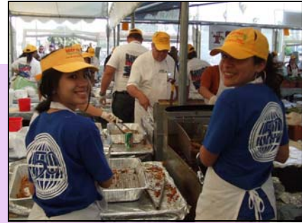
In celebration of Global Youth Service Day, PTPI's Central Valley, California (Stockton) Student Chapter members worked 54 six hour shifts at the Stockton Asparagus Festival to raise money for the Piyali Learning Center in Calcutta, India.

3 Continue your service. As a group, think of ways that your team can work to support your GYSD project throughout the year. Use the success of your project to encourage other volunteers to become civically engaged and utilize any partnerships that you have formed to create continual volunteer opportunities.