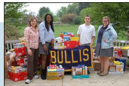
In celebration of Global Youth Service Day 2009, PTPI's Potomac, Maryland (Bullis School) Student Chapter supported the Bullis School's 2nd Annual Cereal Drive. The chapter generated and delivered fliers to members of the local community and collected cereal for the Manna Food Center in Rockville, Maryland.

Expect the unexpected on the day of your project! Have a backup plan ready in case of rain or other delays. Make sure that the project goals are realistic and that the work can be completed by your team. Performing a mid-day assessment may be a good idea to gauge your team's progress. Above all, be prepared to be flexible and work through any obstacles that may arise!