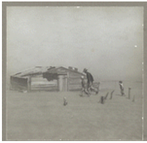
Dust Storm, Kansas

Directions: The teacher assigns or students choose different products to complete.